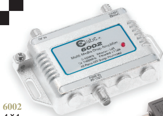
6002 1 X 1