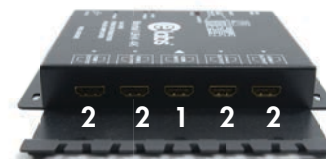
UH4-4K Front View